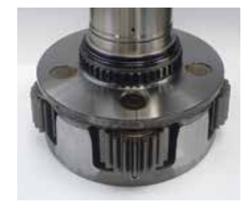
Planetary carrier design improvements provide 7-times the service life over previous design.