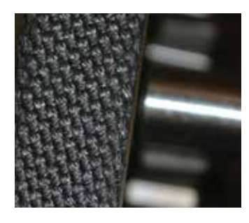
Proprietary synchronizer friction material (EFM-H) improves abuse resistance by more than 200%.

The Eaton synchronized 9-speed ES-11109 has been completely redesigned to improve reliability and provide longer service life. Whether you're hauling freight or dirt, this rugged transmission will meet your needs.